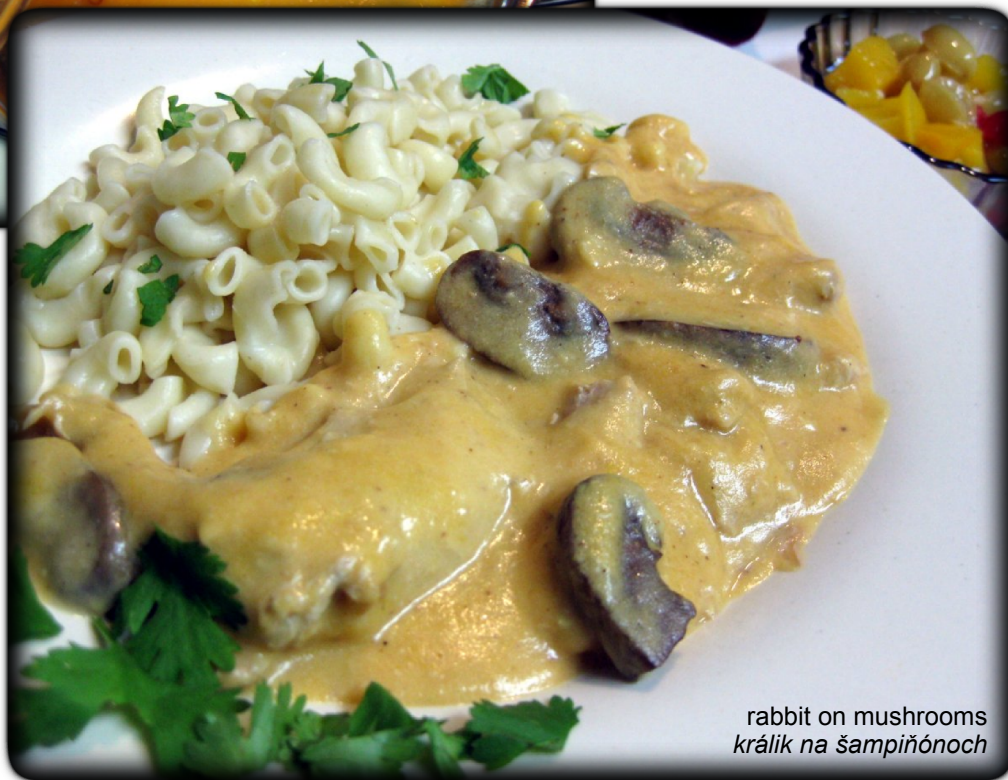
rabbit on mushrooms králik na šampiňónoch